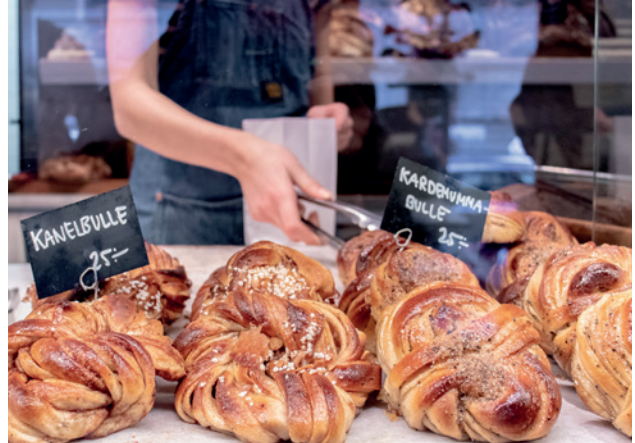
When in Stockholm; have a bulle! Traditional "fika" at most of the coffee shops in the city.

Sweden is one of the largest countries in Europe, with great diversity in its nature and climate. Its distinctive yellow and blue flag is one of the national emblems that reflect centuries of history between Sweden and its Nordic neighbours.