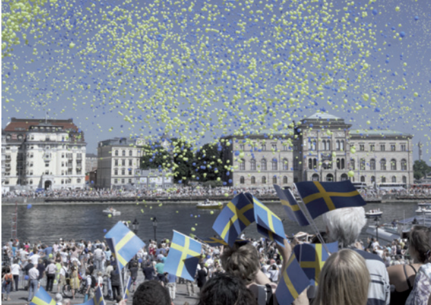
Swedish National Day, June 6th celebration outside the Royal Palace facing the National Museum.