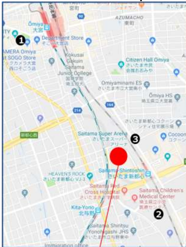
Saitama Super Arena